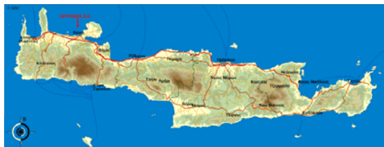
Crete Island ( www.creteisland.gr )