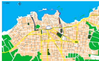
Town map of Chania ( www.chania.gr )