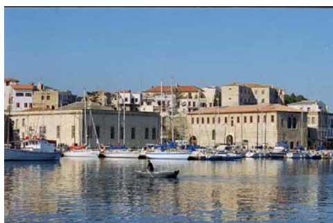
Conference Center: www.kam-arsenali.gr